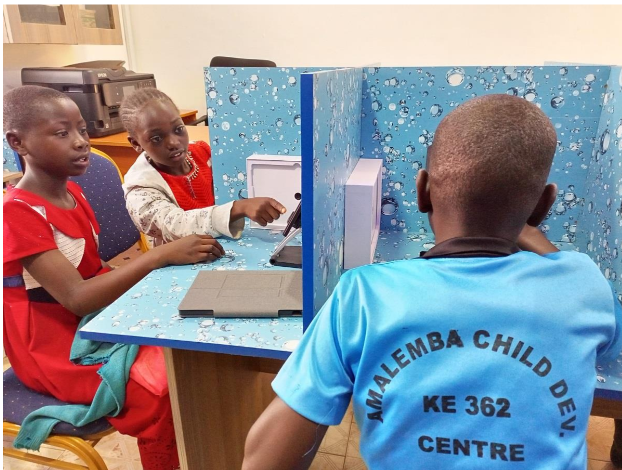
Photo2: Age 9-11 Participants accessing digital devices

This has made learning more appealing to our participants although it was a formidable technique to manage initially since traditional instructors are hesitant to include contemporary technology in lesson delivery, viewing them as a distraction rather than an intelligent learning aid. However, with continuous training, our approach is showing positive signs of fully incorporating technologies in program delivery.