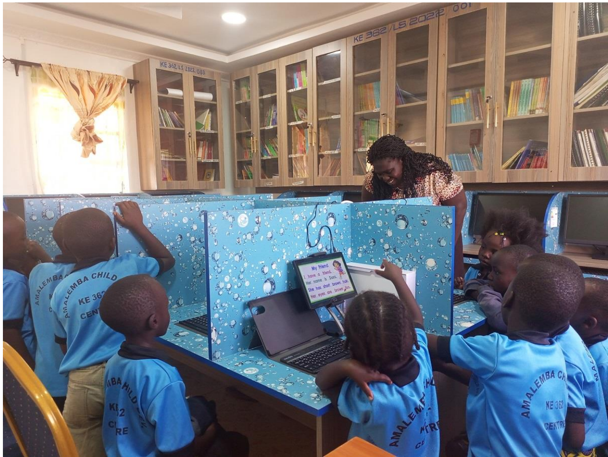
Photo1: Age 3-5 with their teacher during a cognitive lesson

Traditional classroom instructions fall short of providing an immediate learning environment, faster evaluations, and more engagement. In contrast, at Ke0362, digital learning tools and technology has filled this void. Some of the efficiencies such technologies provide are simply unrivalled by traditional learning methodologies.